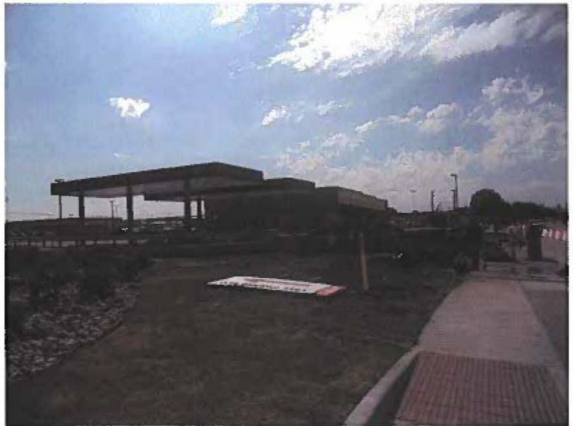
Prepared by: Ricondo & Associates, Inc., April 2013.