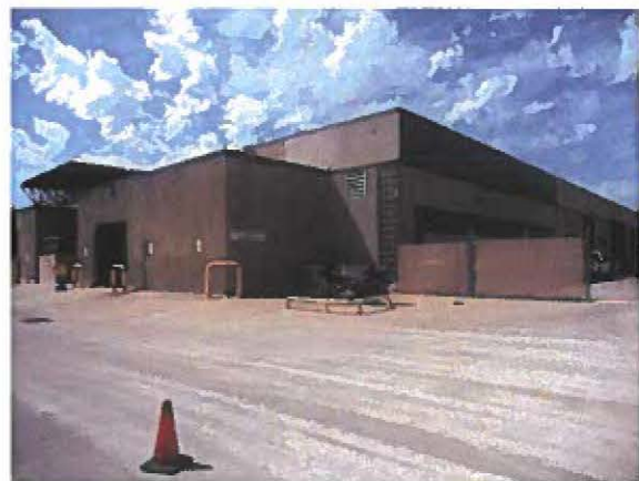
Prepared by: Ricondo & Associates, Inc., April 2013.