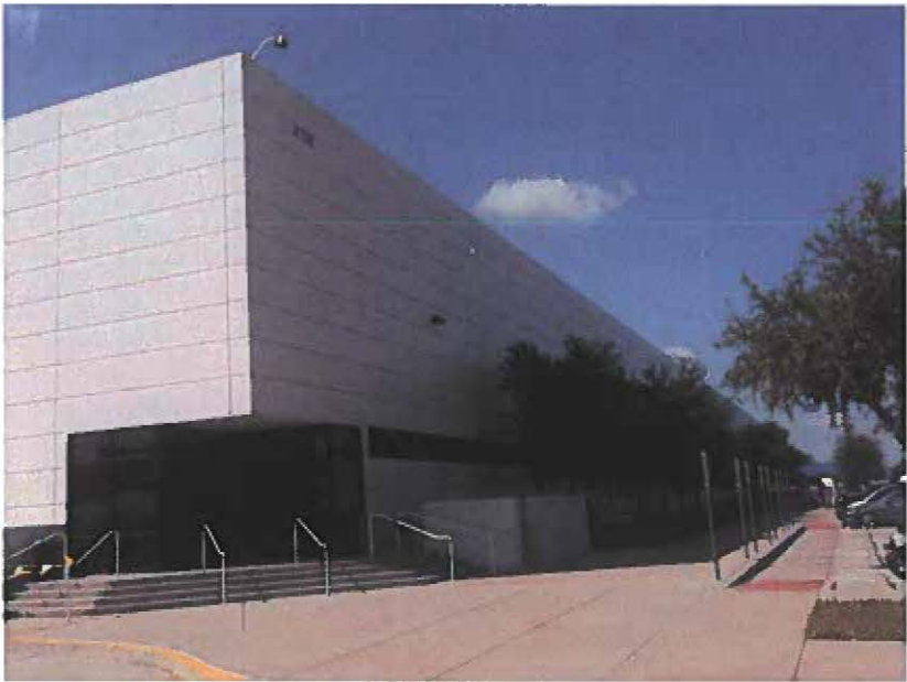
Prepared by: Ricondo & Associates, Inc., April 2013.