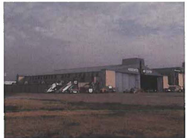
Prepared by: Ricondo & Associates, Inc., April 2013.