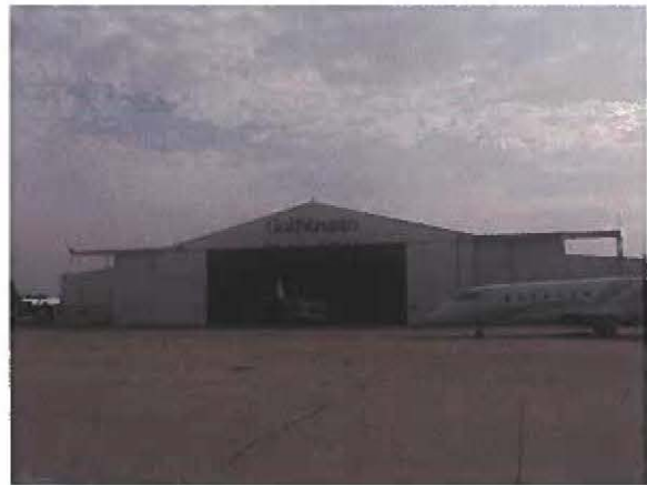
Prepared by: Ricondo & Associates, Inc., April 2013.