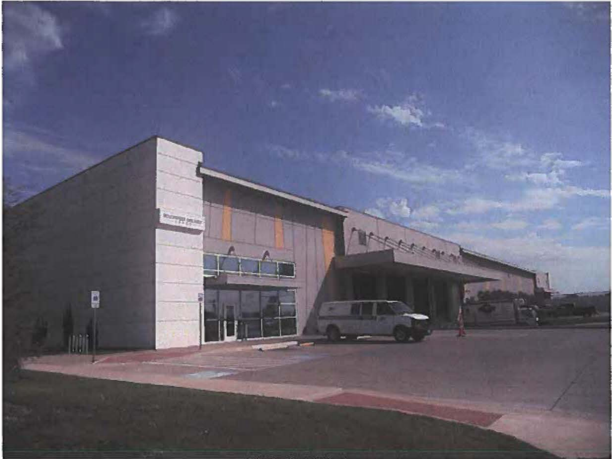
Prepared by: Ricondo & Associates, Inc., April 2013.