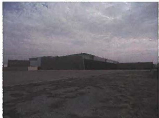
Prepared by: Ricondo & Associates, Inc., April 2013.