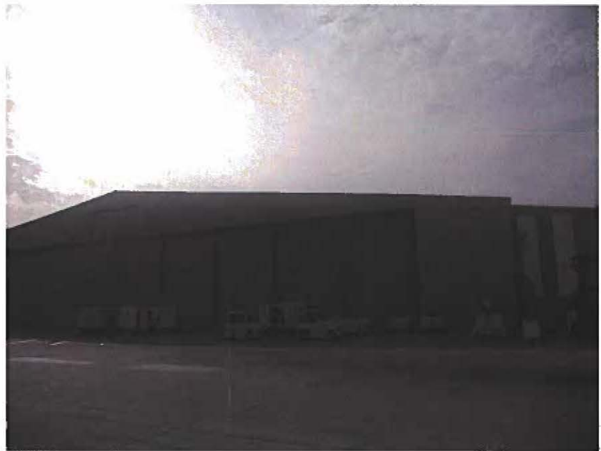
Prepared by: Ricondo & Associates, Inc., April 2013.