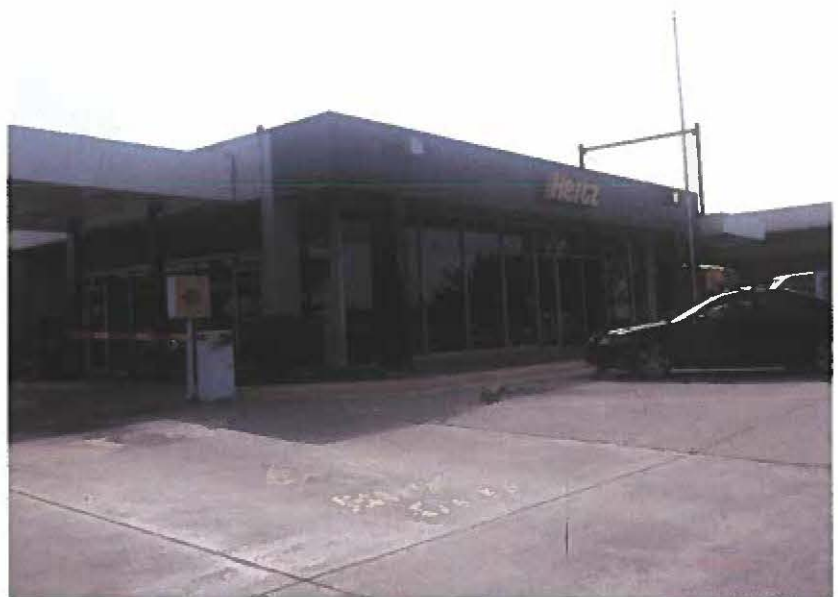
Prepared by: Ricondo & Associates, Inc., April 2013.