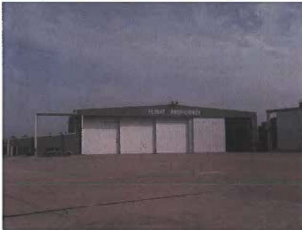
Prepared by: Ricondo & Associates, Inc., April 2013.