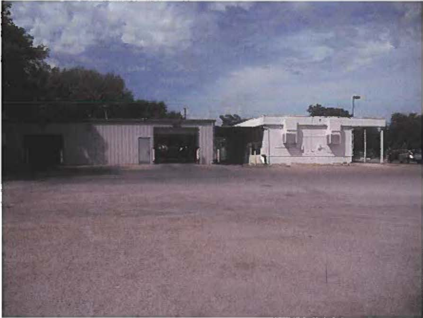
Prepared by: Ricondo & Associates, Inc., April 2013.