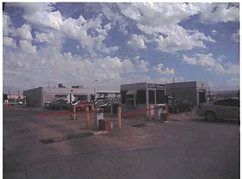
Prepared by: Ricondo & Associates, Inc., April 2013.