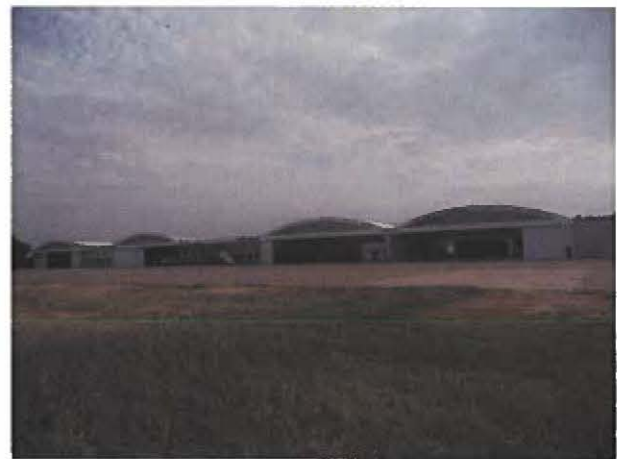
Prepared by: Ricondo & Associates, Inc., April 2013.