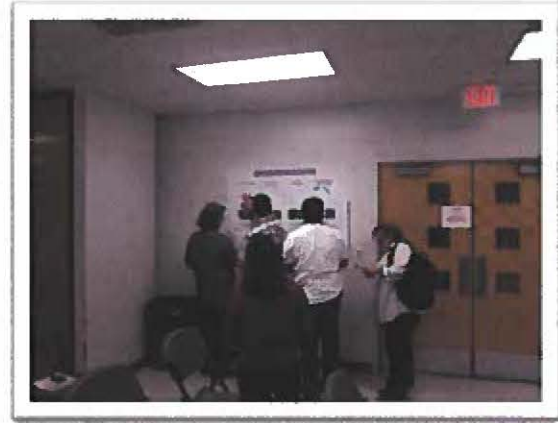
Meeting attendees participating in the Breakout Activity