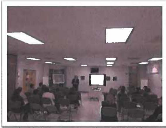
East Zone Resident Meeting (North)