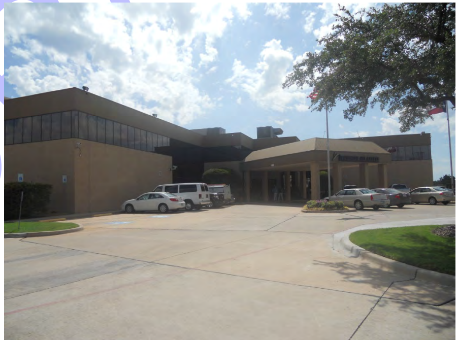
Prepared by: Ricondo & Associates, Inc., April 2013.