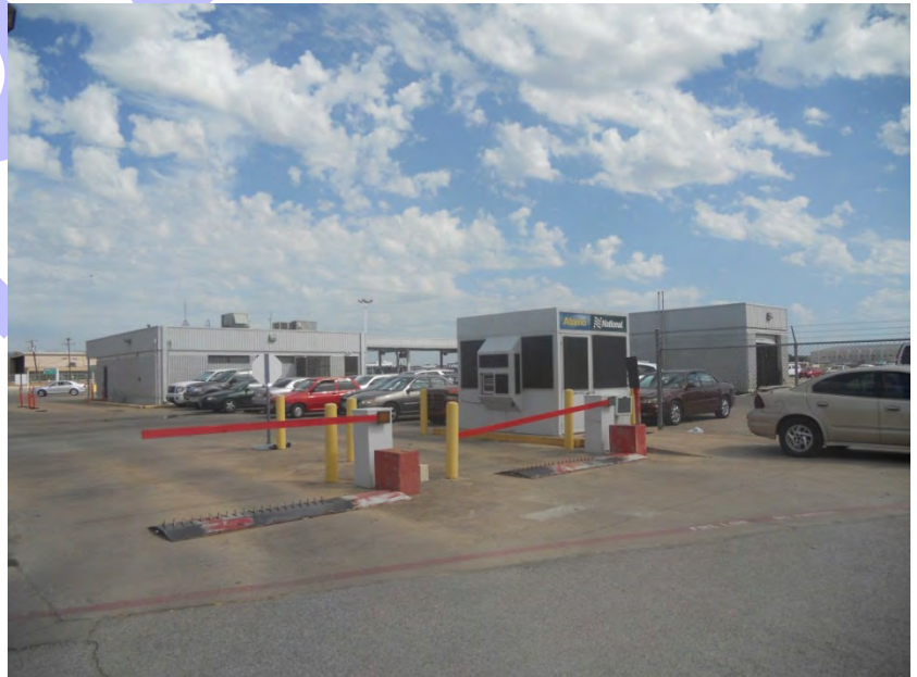
Prepared by: Ricondo & Associates, Inc., April 2013.