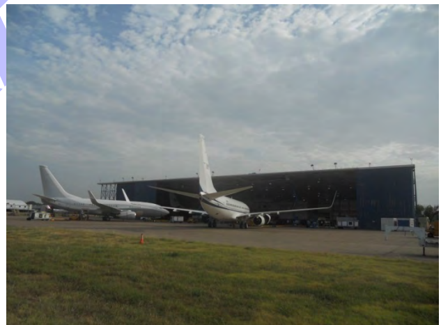
Source: Photographs taken by Ricondo & Associates, Inc., July 2012. Prepared by: Ricondo & Associates, Inc., April 2013.