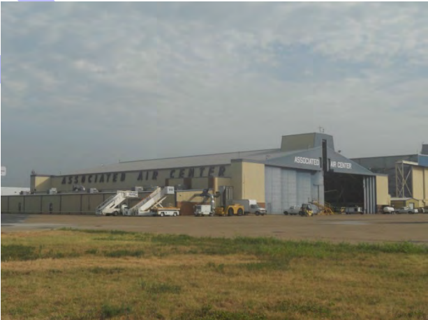
Prepared by: Ricondo & Associates, Inc., April 2013.