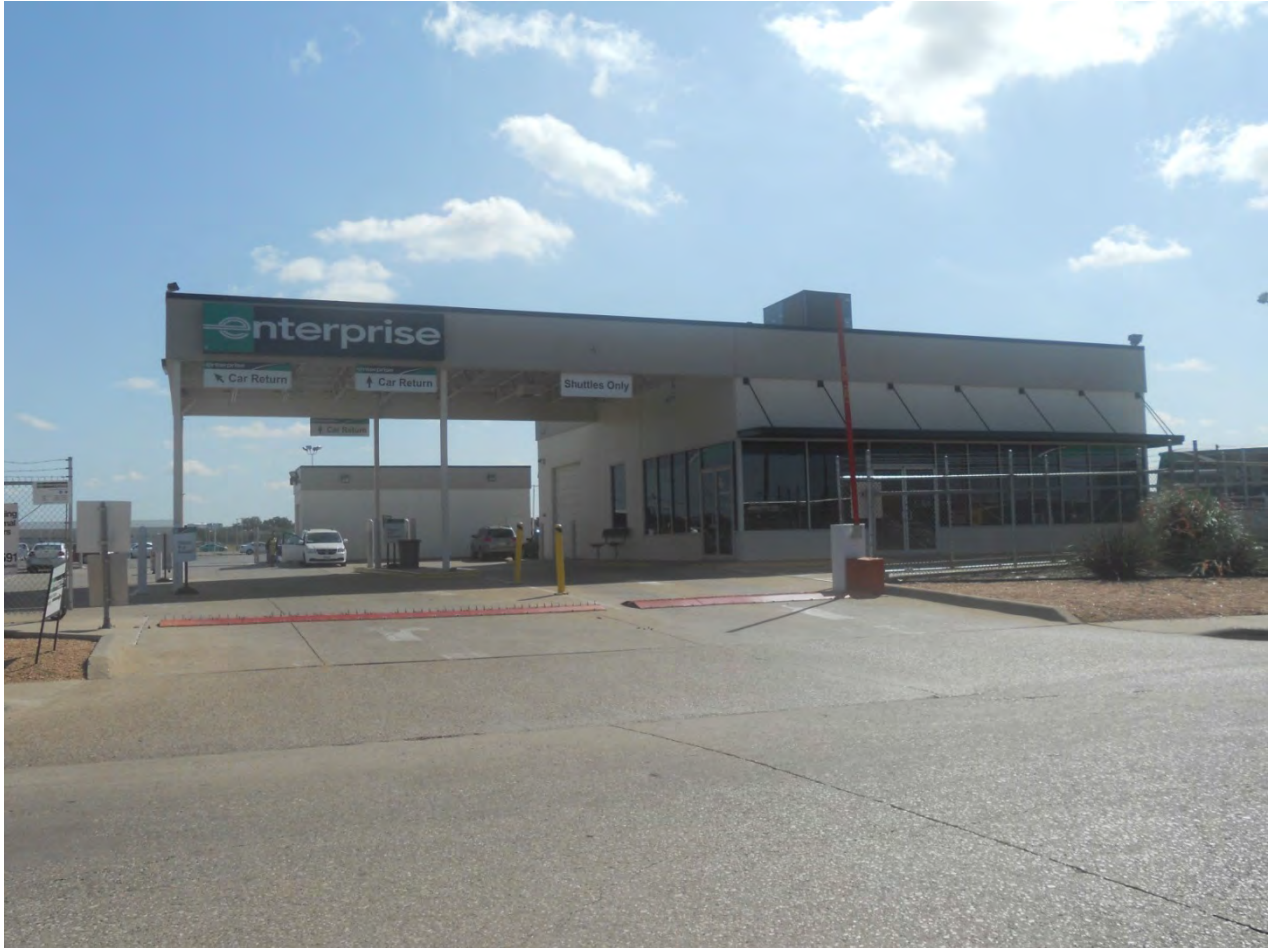
Prepared by: Ricondo & Associates, Inc., April 2013.