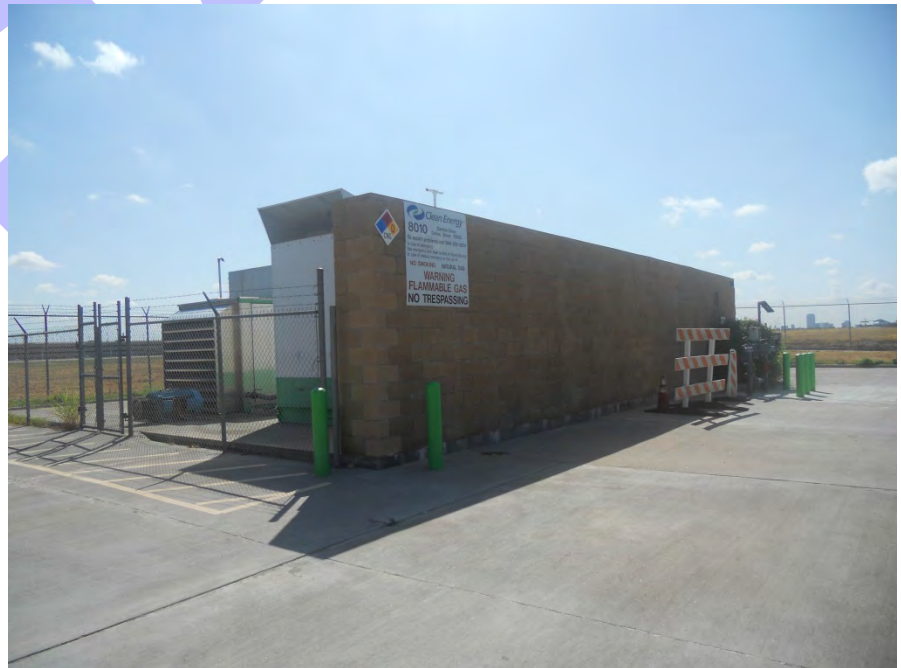
Prepared by: Ricondo & Associates, Inc., April 2013.