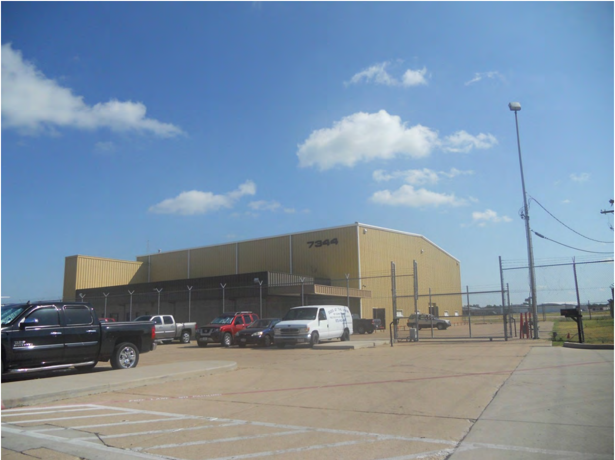
Prepared by: Ricondo & Associates, Inc., April 2013.