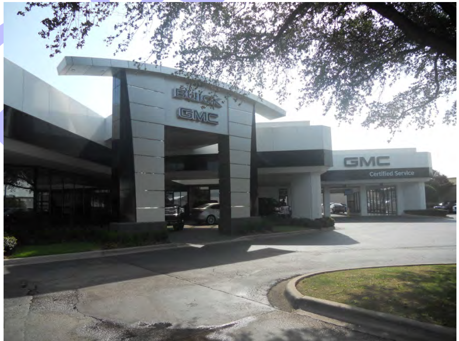
Prepared by: Ricondo & Associates, Inc., April 2013.