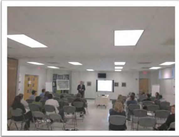
East Zone Resident Meeting (North)