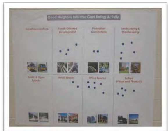
Example of a completed Breakout Activity Board