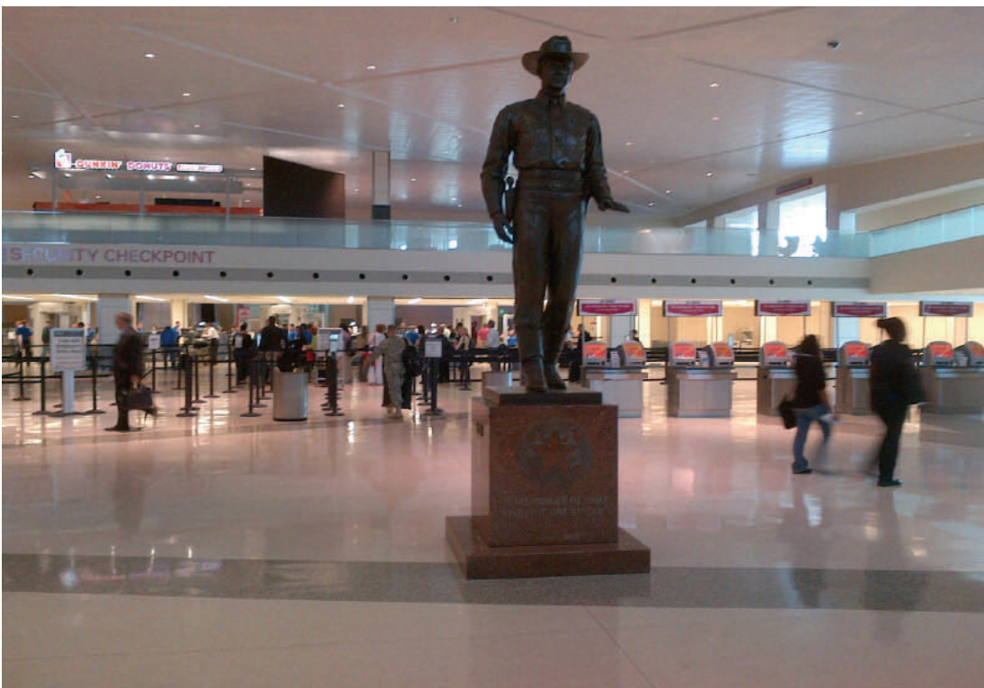
"One Riot, One Ranger"

The 12-foot tall Texas Ranger of 1960 bronze statue is once again standing guard in the main lobby of the terminal.