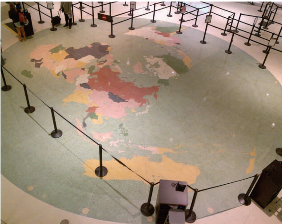
The terrazzo world map on the lobby floor is one of the original art pieces preserved during the Love Field Modernization Project.

For more information and updates about the Love Field Modernization Project (LFMP) please visit: http://www.lovefieldmodernizationprogram.com/