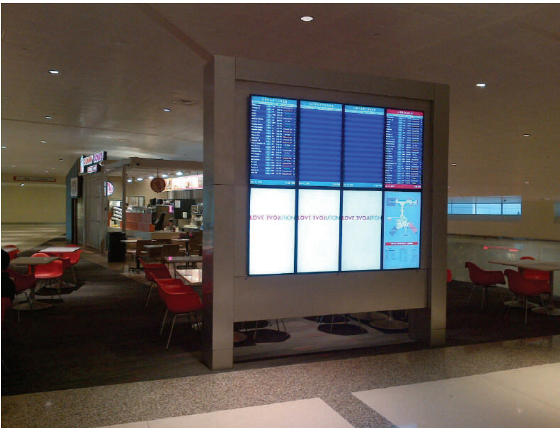
Flight Information Display in Love Landing. Love Landing is located on the second level of the main terminal.

For more information and updates about the Love Field Modernization Project (LFMP) please visit: http://www.lovefieldmodernizationprogram.com/