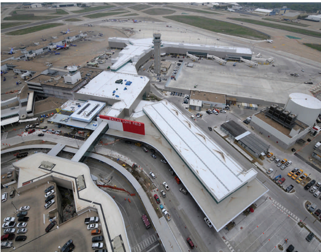
Aerial view of Dallas Love Field showing the ticketing hall, terminal and new concourse.

For more information and updates about the Love Field Modernization Project (LFMP) please visit: http://www.lovefieldmodernizationprogram.com/