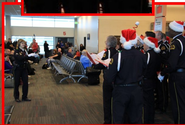
Happy Holidays from Dallas Love Field! Photos above taken of the Love Field Christmas Tree and the Dallas Police Choir spreading holiday cheer throughout the main terminal.